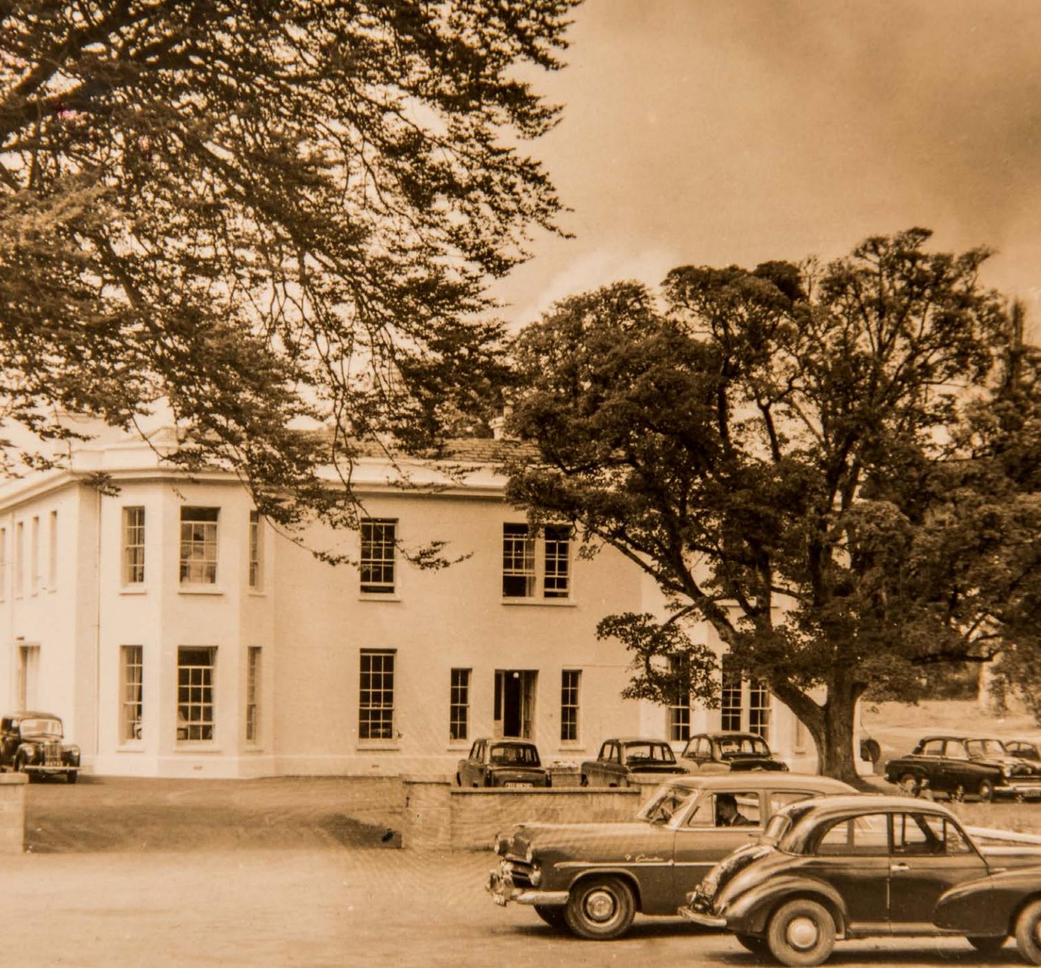
The Gleneagle Hotel opened its doors in 1957